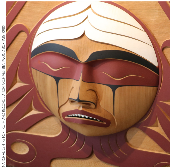
NATIONAL CENTRE FOR TRUTH AND RECONCILIATION ARCHIVES, BENTWOOD BOX, IMG_0985

Judges gained an overview of the landscape of Indigenous law initiatives across Canada and learned about how to integrate Indigenous laws in the judicial process. The first part of the seminar was devoted to community initiatives aimed at revitalizing and developing Indigenous laws. It focused on customary adoption and child welfare; governance; natural resource management; and restorative approaches to criminal justice. The second part of the seminar examined the issues from the perspective of Canadian judges, who are being asked to account for, recognize, and apply Indigenous laws. The seminar featured noted experts on Indigenous law, such as Aaron Mills and John Borrows.