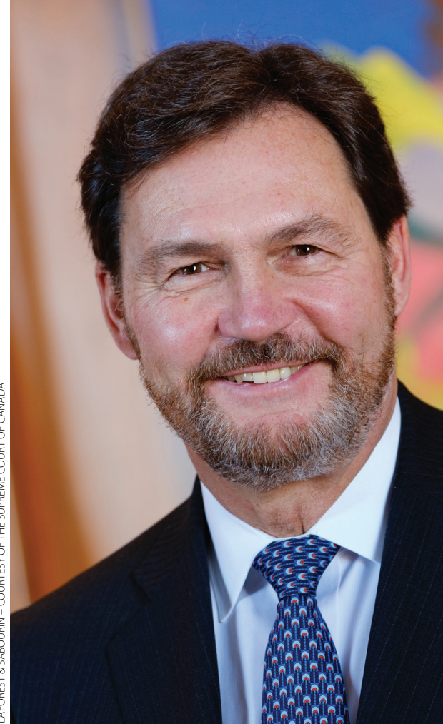
The Right Honourable Richard Wagner, P.C. Chief Justice of Canada Chair, NJI Board of Governors