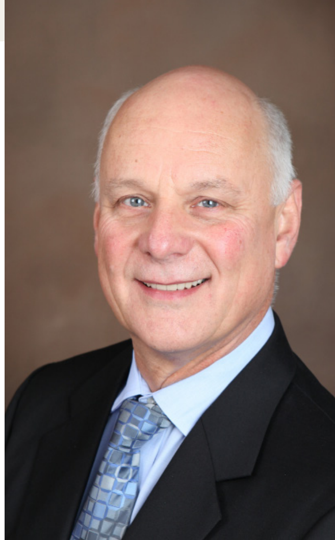
The Honourable Justice Tom Crabtree Chief Judicial Officer, NJI

At the same time, we are re-evaluating and refining the content of NJI's curriculum to ensure a balanced, integrated, and robust approach to the dimensions of judicial education—substantive law, skills, and social context.