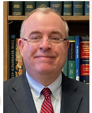
The Honourable Justice Christopher J. Mainella Court of Appeal of Manitoba

“The Evidence Snapshot Series Workshop was an example of the “adapt and overcome” spirit of the pandemic. Participants were able to gather in a safe virtual setting to discuss and collaborate on the problems addressed in the evidence snapshots. The new and remote learning opportunities provided by the NJI helped ensure that the Canadian public continues to enjoy one of the best-educated judiciaries in the world, dedicated to upholding the rule of law.”